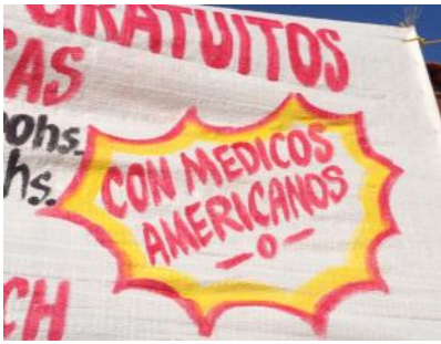
“With American Doctors”