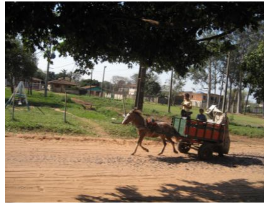
Horse and cart transportation in Paraguay