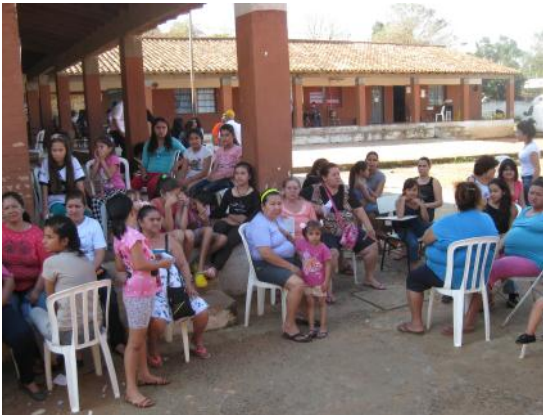
Patients lined up early and waited throughout the day with their children in 90-100 degree heat in the “Paraguayan winter”