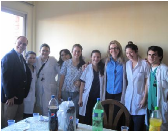
Medical mission volunteers posing for a photo after taking a lunch break