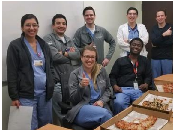
WSU/APRH residents take a much need break and enjoy a meal provided by MAFP/FMFM