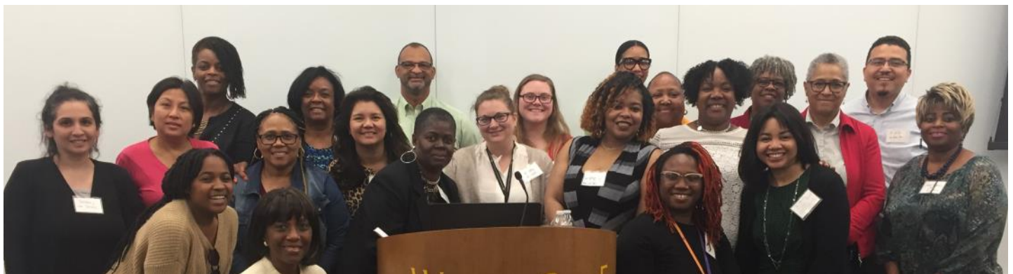
Pictured below: Microaggression trainees from the WSU community