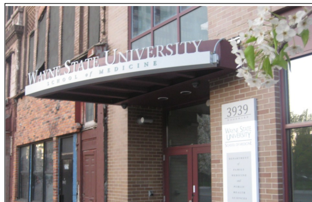
Wayne State University installed signage on the Woodward Gardens building for Department of Family Medicine and Public Health Sciences. Office space for DFMPHS faculty and staff is on the 2nd and 3rd floors.

Although it won't be necessary to entice you to read the newsletters, we will reward one lucky reader. In each newsletter we will feature a hidden word. When you find the hidden word, send an email letting us know the